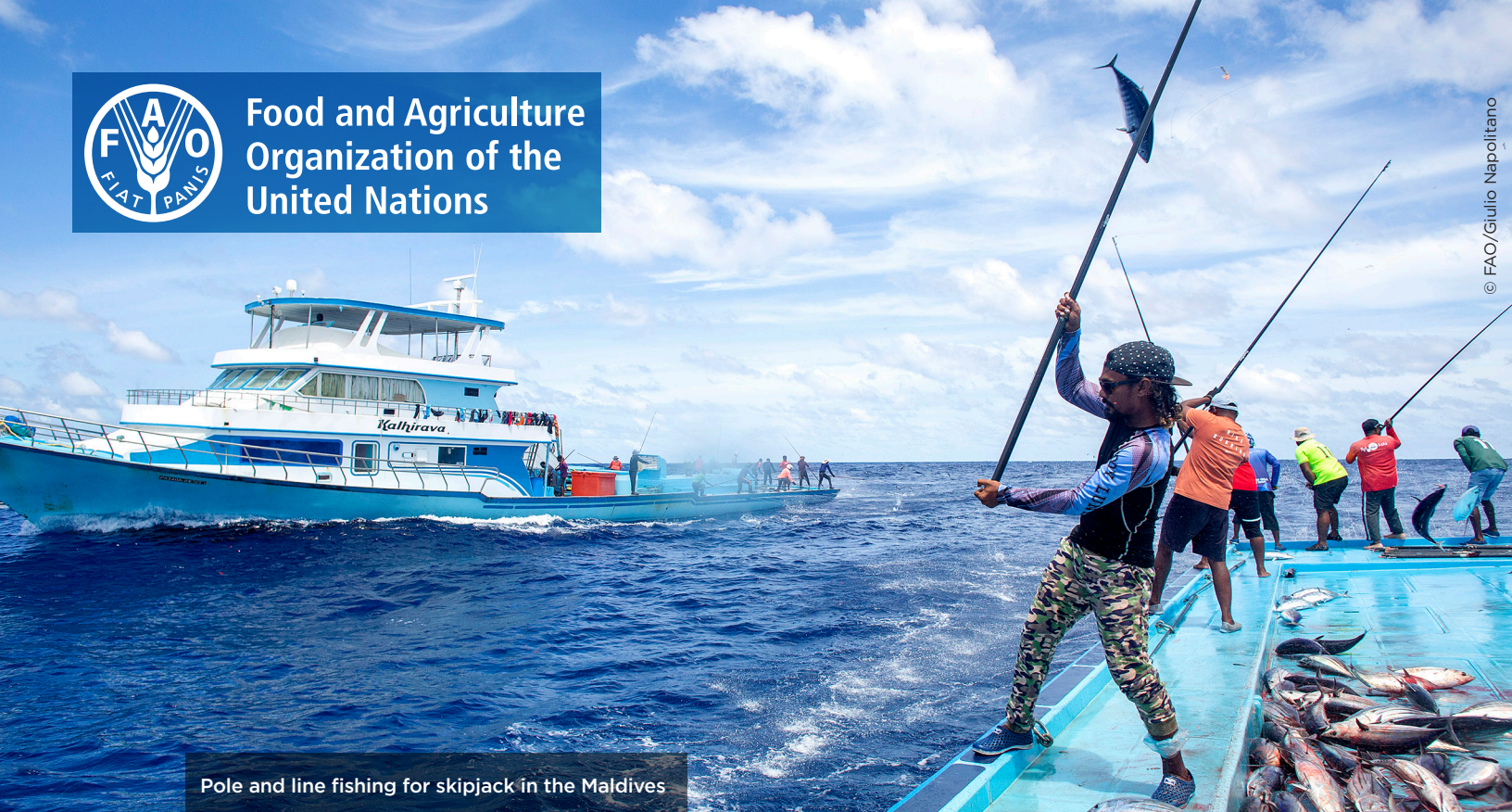
Pole and line fishing for skipjack in the Maldives

Food and Agriculture Organization of the United Nations