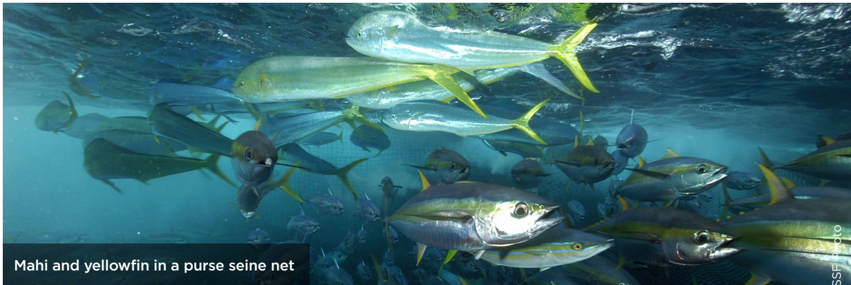
Mahi and yellowfin in a purse seine net

The bottom line is that stock assessments provide a limited basis for decision-making in an uncertain system with conflicting data sources. MSE, on the other hand, enables the selection of an MP that managers can be confident will achieve their objectives into the future. An MP is all about long-term planning for efficient and results-driven management, which is why MPs are replacing the traditional approach in both international and domestic fisheries worldwide.