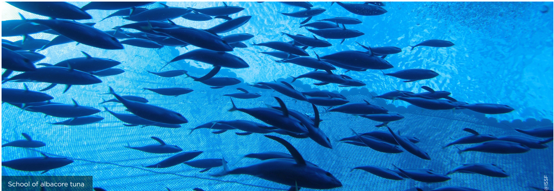
School of albacore tuna