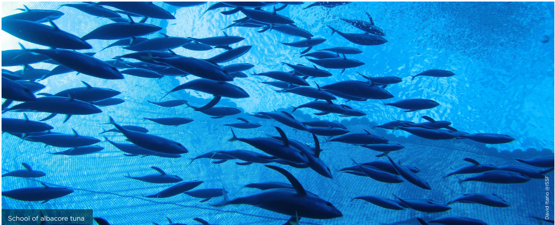
School of albacore tuna