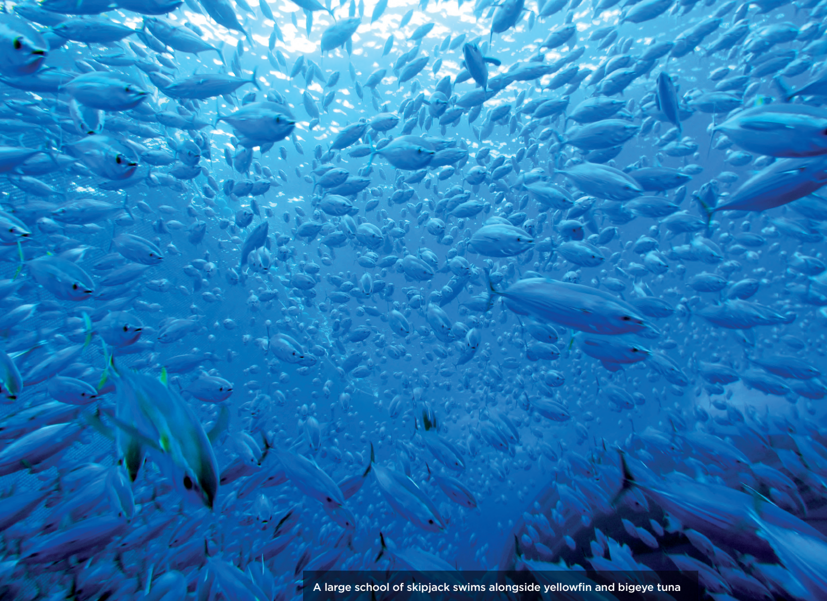
A large school of skipjack swims alongside yellowfin and bigeye tuna